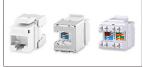
Figure 1: Wiring Schemes