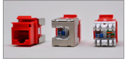
Figure 1: Wiring Schemes