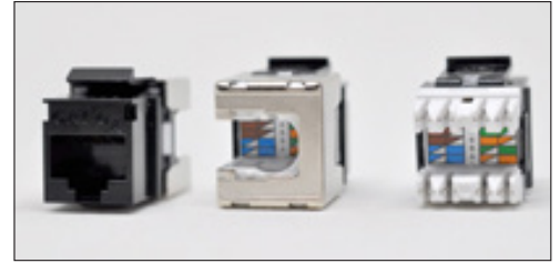
Figure 1: Wiring Schemes