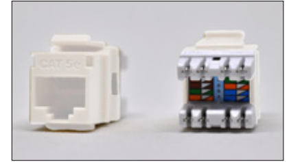
Figure 1: Wiring Schemes