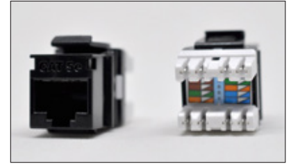
Figure 1: Wiring Schemes